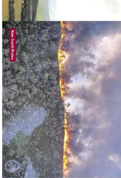
New South Wales