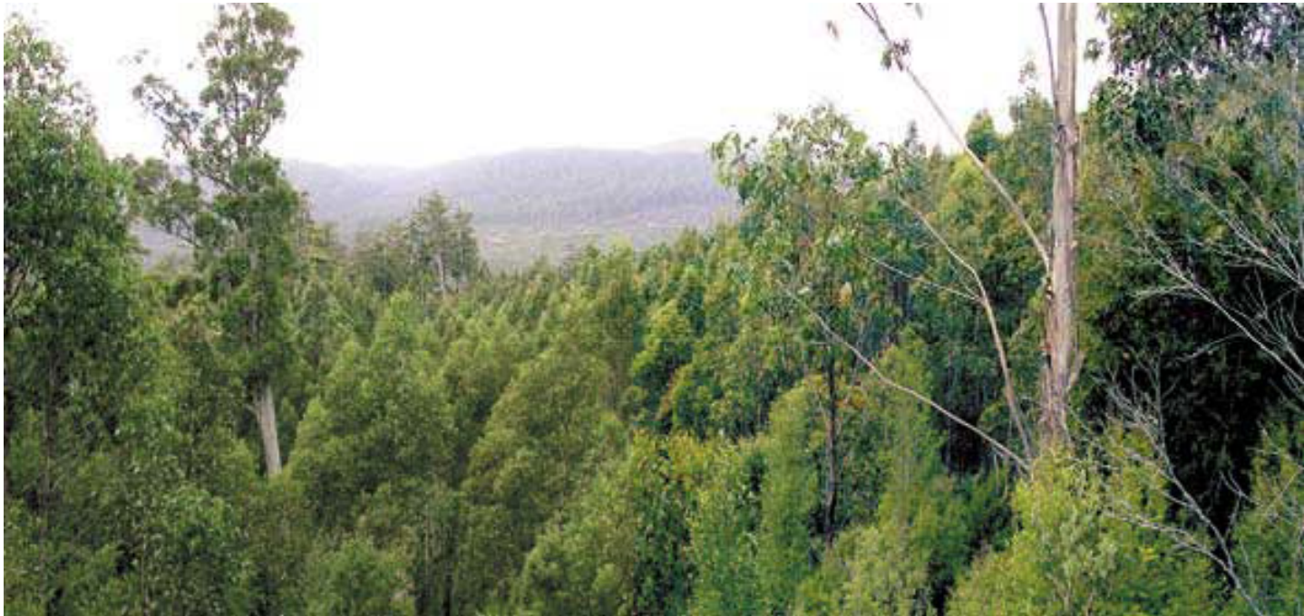
The forest reborn and regrowing in 2006